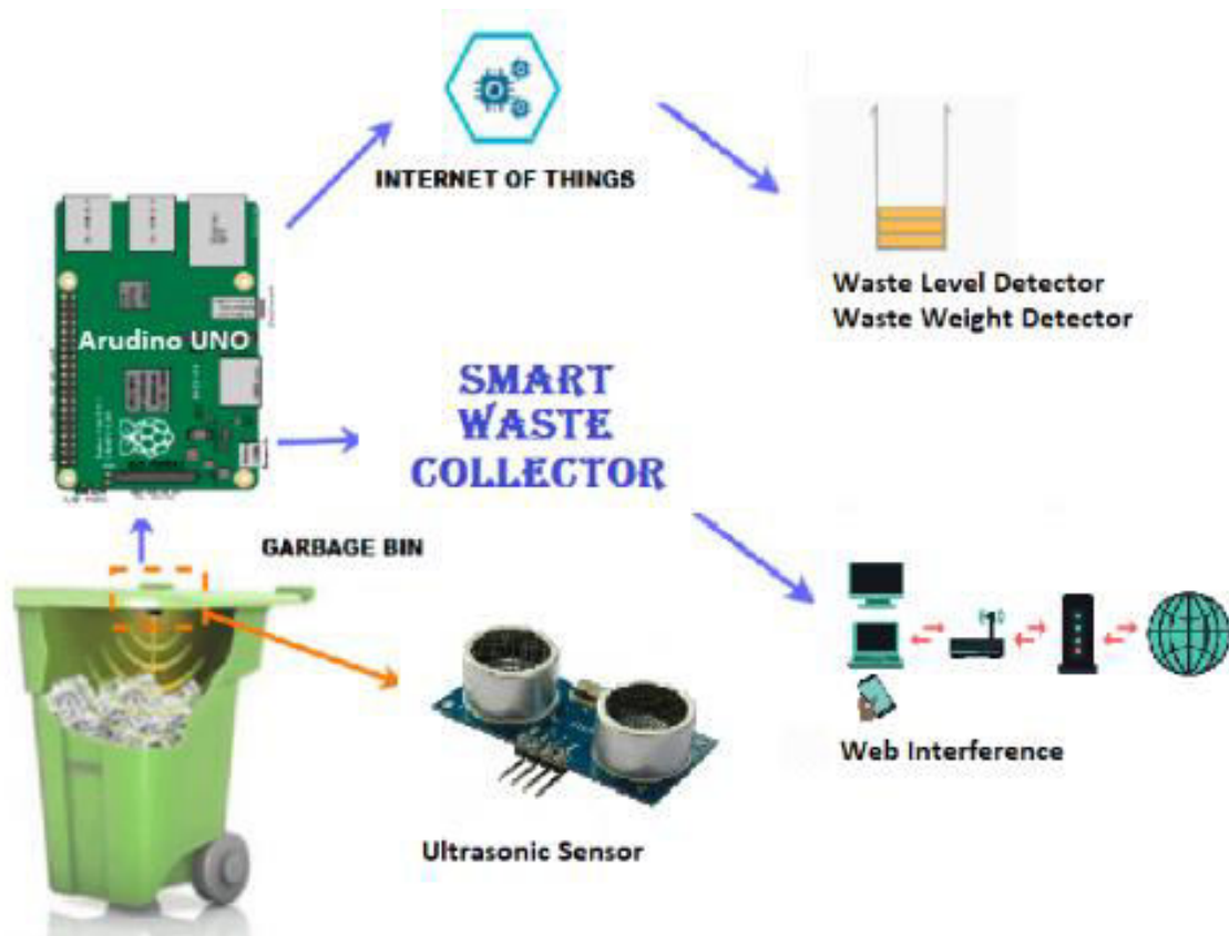
Figure 1 Graphical Presentation of Framwork

a website page. The ESP8266 Wi-Fi Module is an independent SOC with a coordinated TCP/IP convention stack that can give any microcontroller access to your Wi-Fi module.